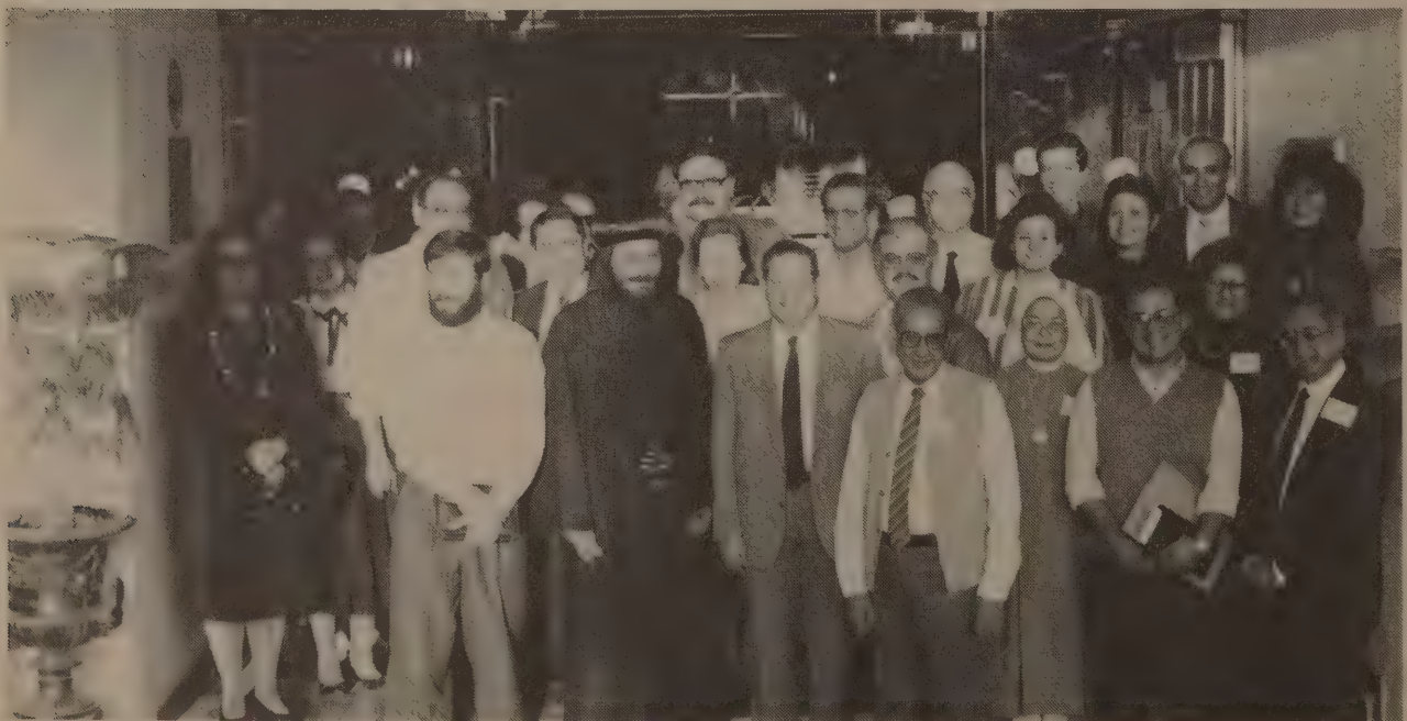
Participants in the Middle East Council of Churches (MECC) consultation on Health, Healing, and Wholeness.

Participants agreed that church-related health programmes and the community together should decide on their priorities, and follow-up and evaluation of health projects should be ongoing. *